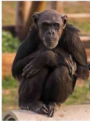
Cheeta rehabilitated in Rainfer

Rainfer's activity is not remunerated and does not produce incomes. It has been calificated as "Non-profit Organization" and declared as being of "Public Interest" by the CAM (Autonomous Community of Madrid).