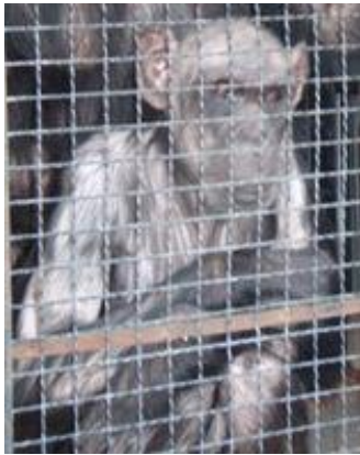
Arrival of Cheeta from circus, 2007

The major task of the Center consists in the rehabilitation, the maintenance and the integration of the primates in new social groups, to be able to offer them a new opportunity to live with dignity, how they deserve, and become primates again.